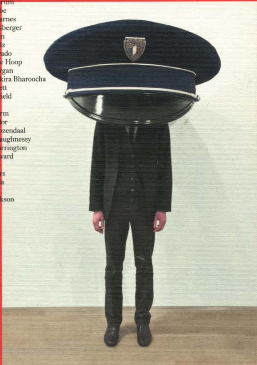
Erwin Wurm - French Police Cap, 2010